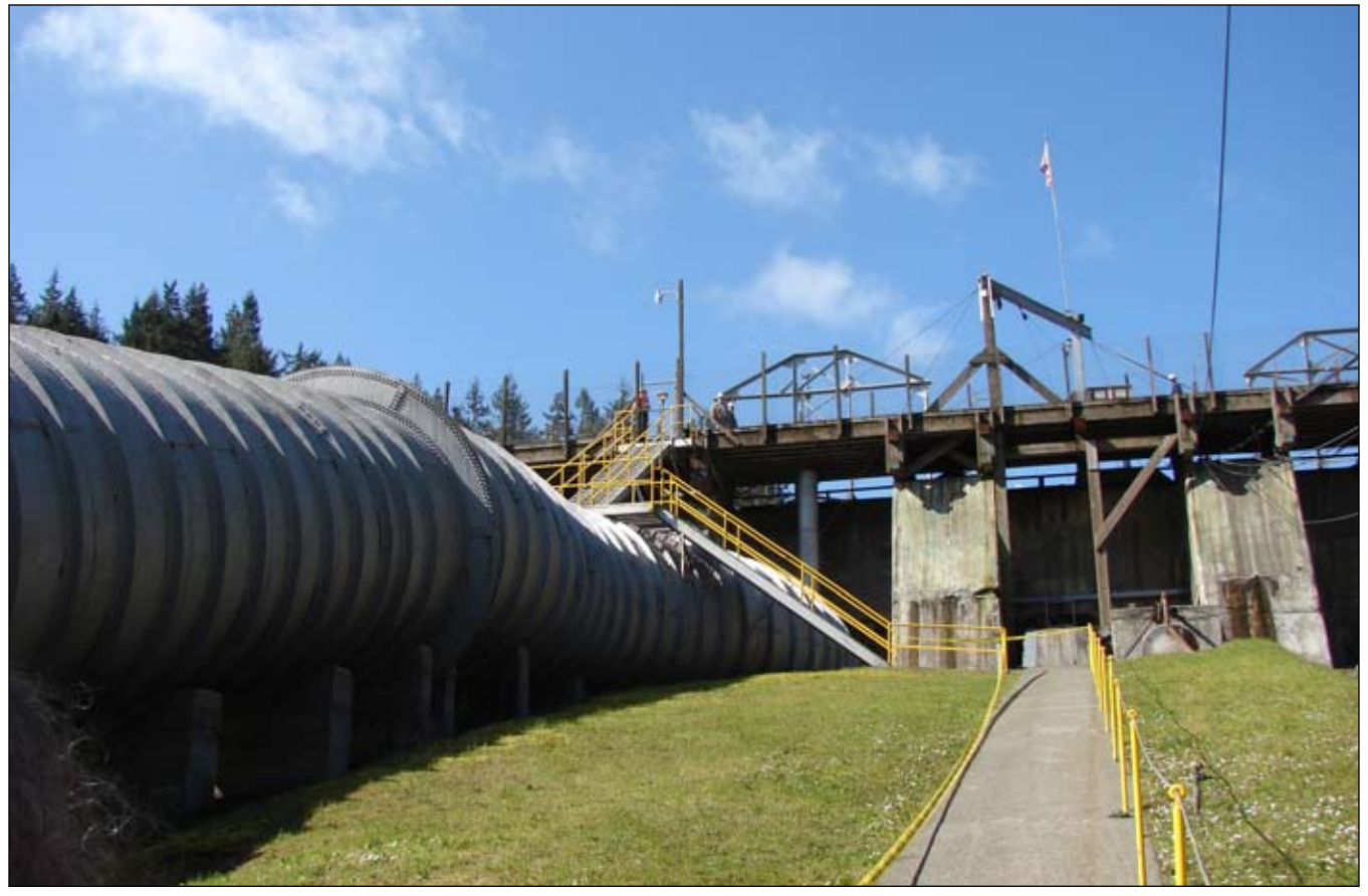
Elwha Dam walk-through