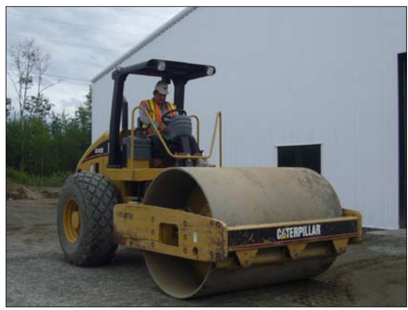
Big Lake Ice Rink in Alaska - Jim Simonds