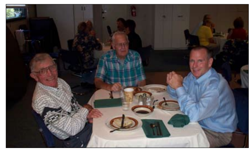
District 3 Retirement Party - Poulsbo