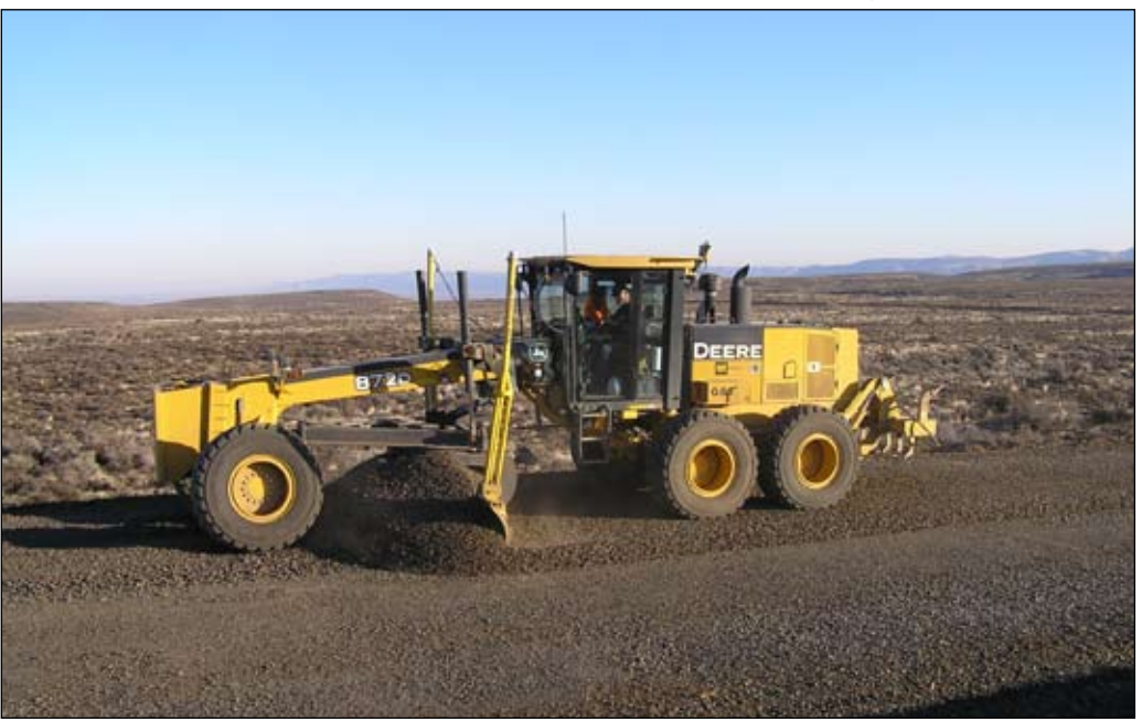
Kittitas Valley Windpower Project