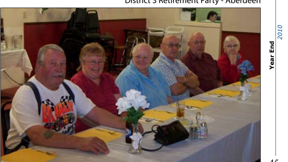
District 3 Retirement Party - Aberdeen