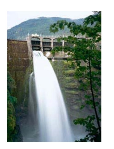
Glines Canyon Dam