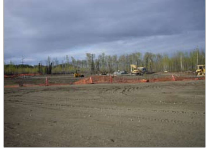
The newly built ice rink in Big Lake, AK