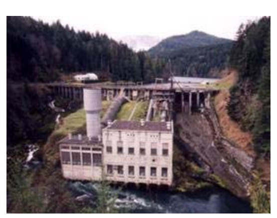
Elwah Dam