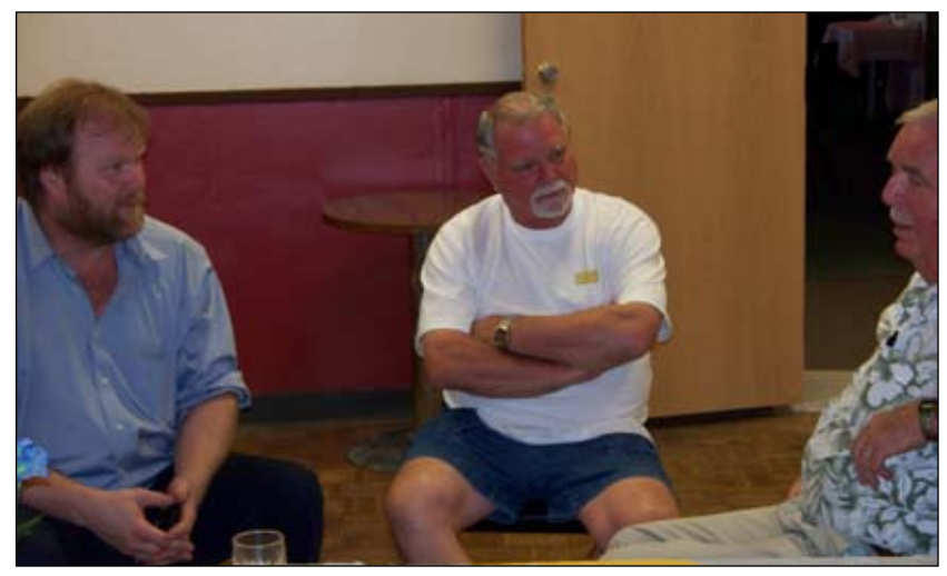
District 3 Retirement Party - Aberdeen