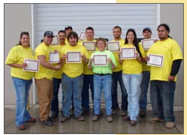
Entry level apprentices help make the day a success