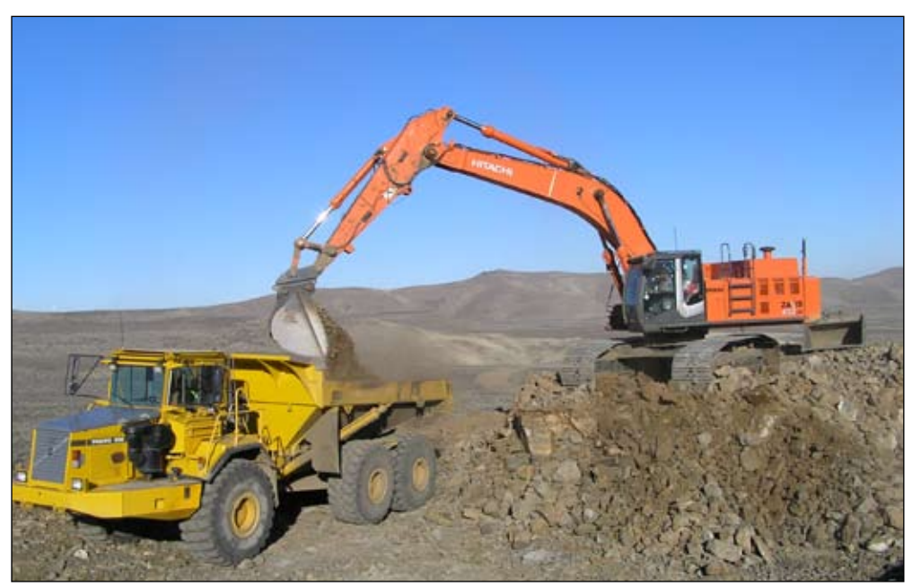
Kittitas Valley Windpower Project