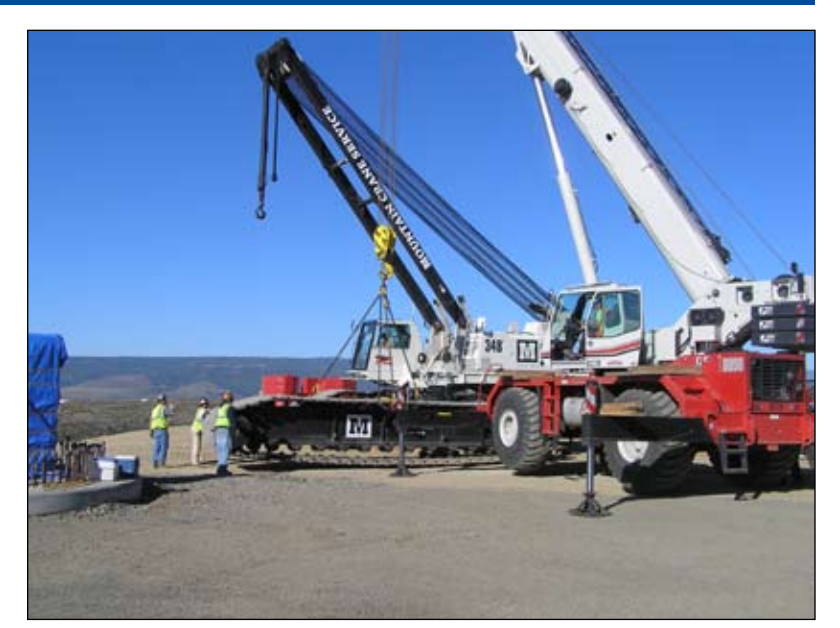
Kittitas Valley Windpower Project