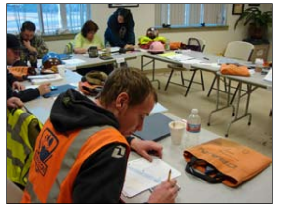
Crunching numbers in the Grade Checking Course at the training center

Because of high demand, we are looking at running some of the classes that filled so quickly on into the summer. If there is enough demand, we will continue to run CDL and Grade courses and will check with dispatchers at the Locals to see which other courses we may need to continue.