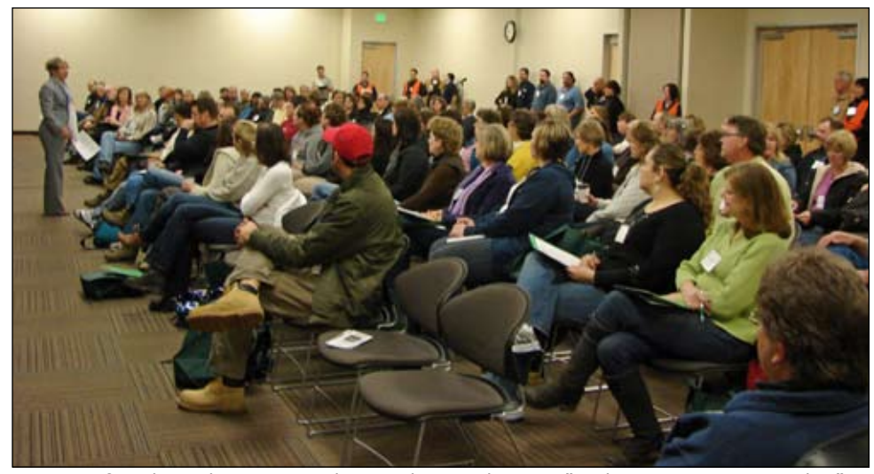
A group of Snohomish county teachers and counselors at a "Pathways to Apprenticeship" event where they learn about apprenticeship as an attractive alternative to the way they normally think about post secondary education.

We continue to do limited outreach but have shifted our focus to educating middle and high school teachers and counselors about the learning opportunity that apprenticeship offers to their students as a valuable alternative to a four year institution. Many of the apprenticeships in Washington State have articulation agreements with accredited community and technical colleges that allow an apprentice who successfully completes their apprenticeship to take a few other required college level courses and earn a 2 year associate's degree. We want to get that word out to educators, parents and our communities in general that apprenticeship is an effective learning model and a great alternative choice for students who prefer to learn in a more hands on environment.